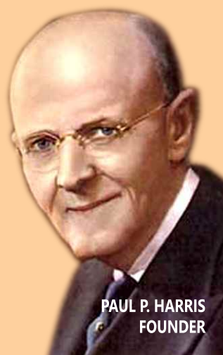
PAUL P. HARRIS FOUNDER